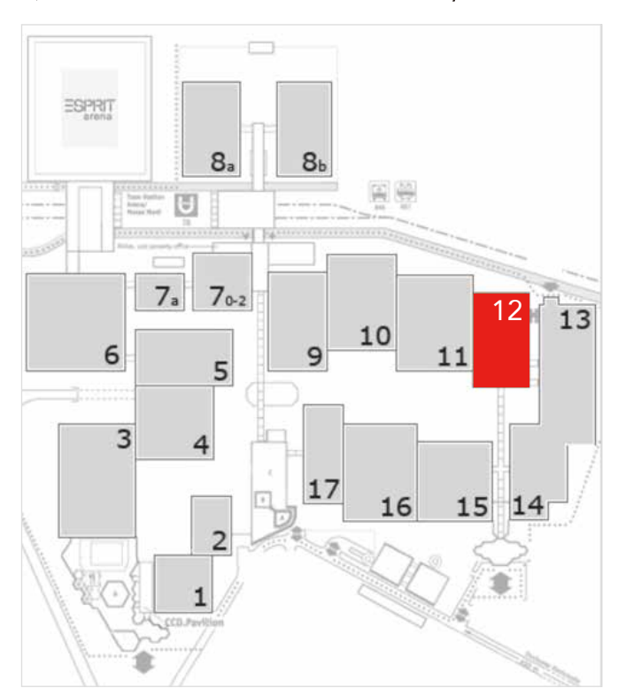
Exhibit booth Hall12 / B20

Location Messe Dusseldolf (Dusseldorf, Germany)